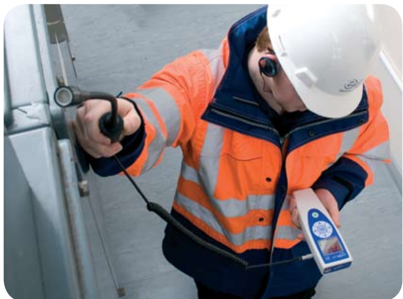
Optional external microphone extends reach.